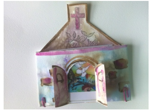
Hand-painted pouch ( designs vary )

Order online at https://shoptoshelter.lilamaeshouse.com/ . Proceeds from the sale of these cards go toward awareness of human trafficking, starting with support for Lila Mae's House.